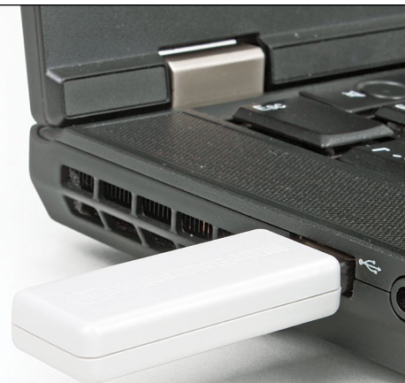
Figure 3: USB Dongle plugged into Laptop USB host connector

Unfortunately not. If you lose your dongle you will need to buy a new compiler license and pay the full price.