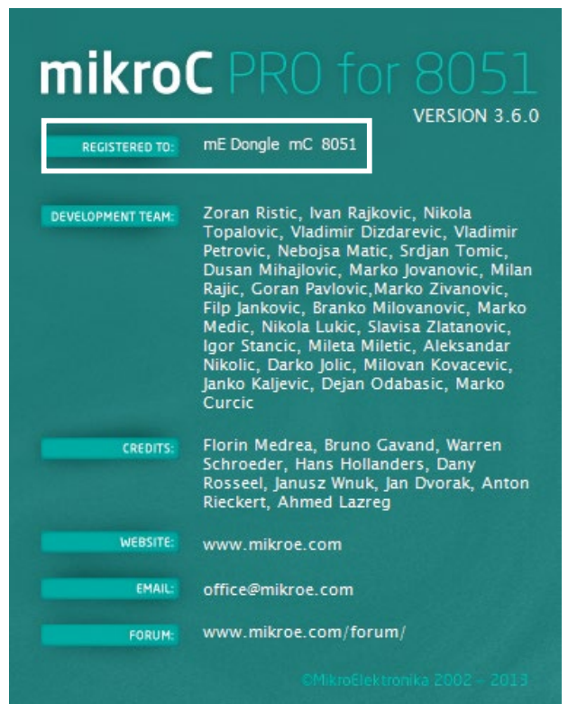
Figure 2: mikroC PRO for 8051 About window