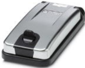
Mounting frame for one front plate/socket, frame: black, cover: metallic, closed with rotary knob.

Please be informed that the data shown in this PDF Document is generated from our Online Catalog. Please find the complete data in the user's documentation. Our General Terms of Use for Downloads are valid ( http://phoenixcontact.com/download )