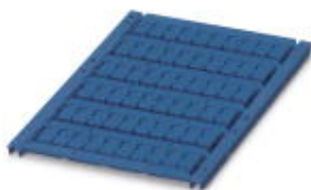
The figure shows the UCT-TM 6 version

UniCard materials for thermal transfer printer, for labeling Weidmüller, Conta Clip, and Klemsan terminal blocks, 60-section, can be labeled with THERMOMARK CARD and BLUEMARK LED, color: blue